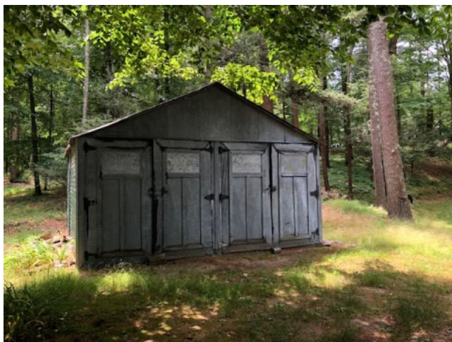
Two car garage 300 feet from cottage.