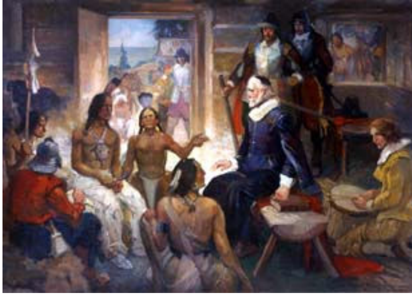
Artist Frank E. Schoonover's rendition of Chief Massasoit's original treaty with the Pilgrims in Plymouth.