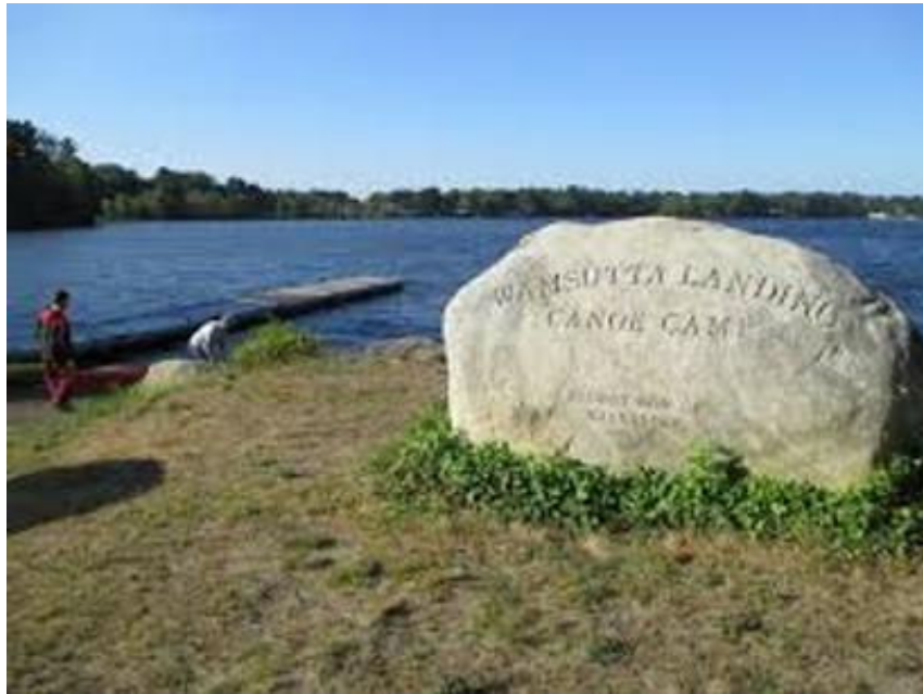
White Island, in the center of the lake, is known to have been the fishing camp of the Wamsutta Indian tribe of which the great Massasoit was Chief.