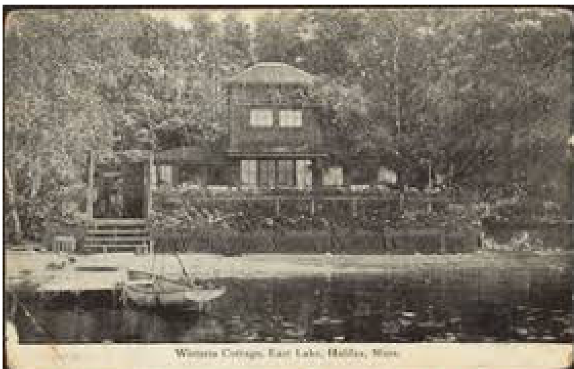
View from the water. An antique post card of Wisteria Cottage .