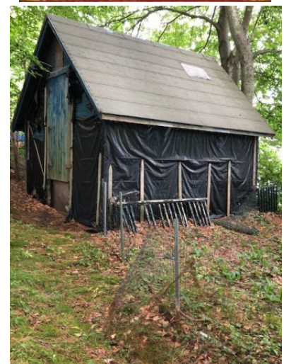
Storage shed in back yard.