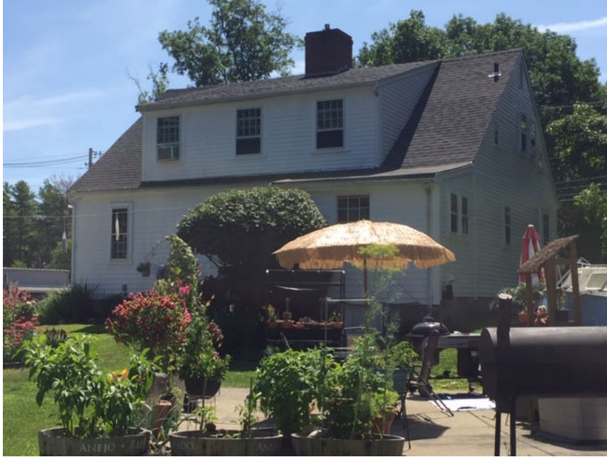
Back Yard Patio