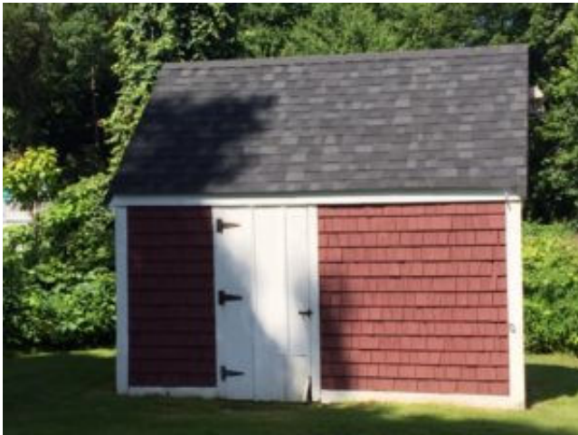
Or Nice Little Guest House