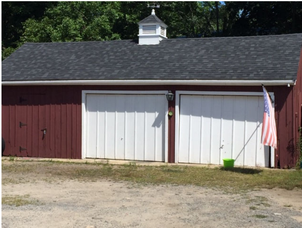
Two Car Garage