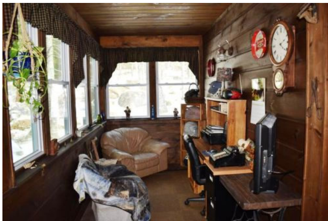
The sunroom currently used for a home office, which, lately, every home is in need of for remote work or remote schooling.