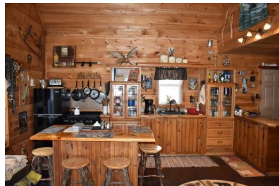
Kitchen with island for food prep and meal enjoyment.