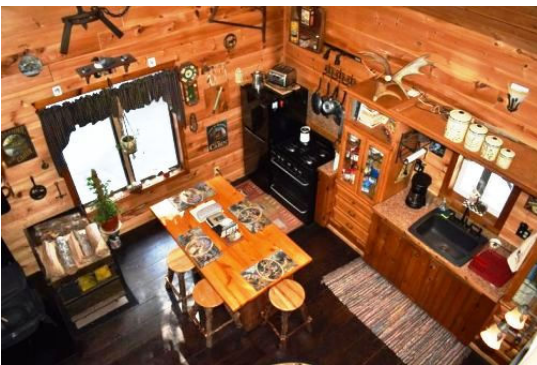
View of kitchen from loft.