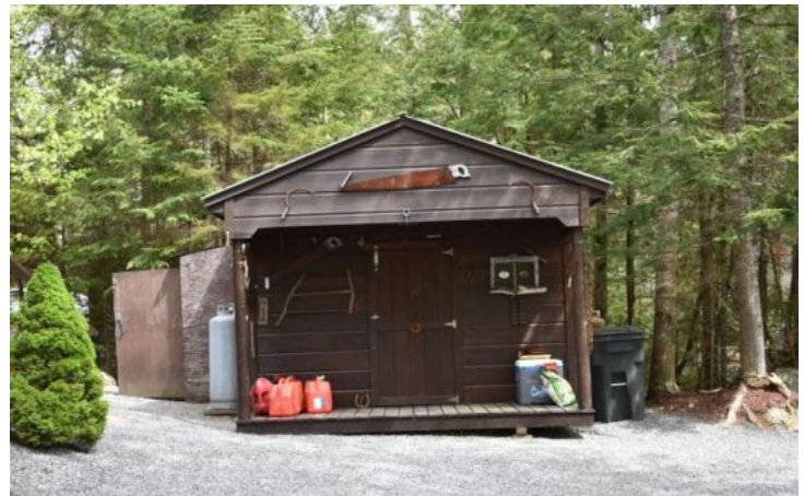
Residence storage shed.