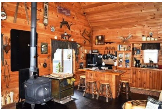
View of kitchen from living room. Plenty of natural light.