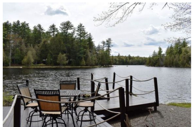
Morning Coffee or Evening Wine at The Dock