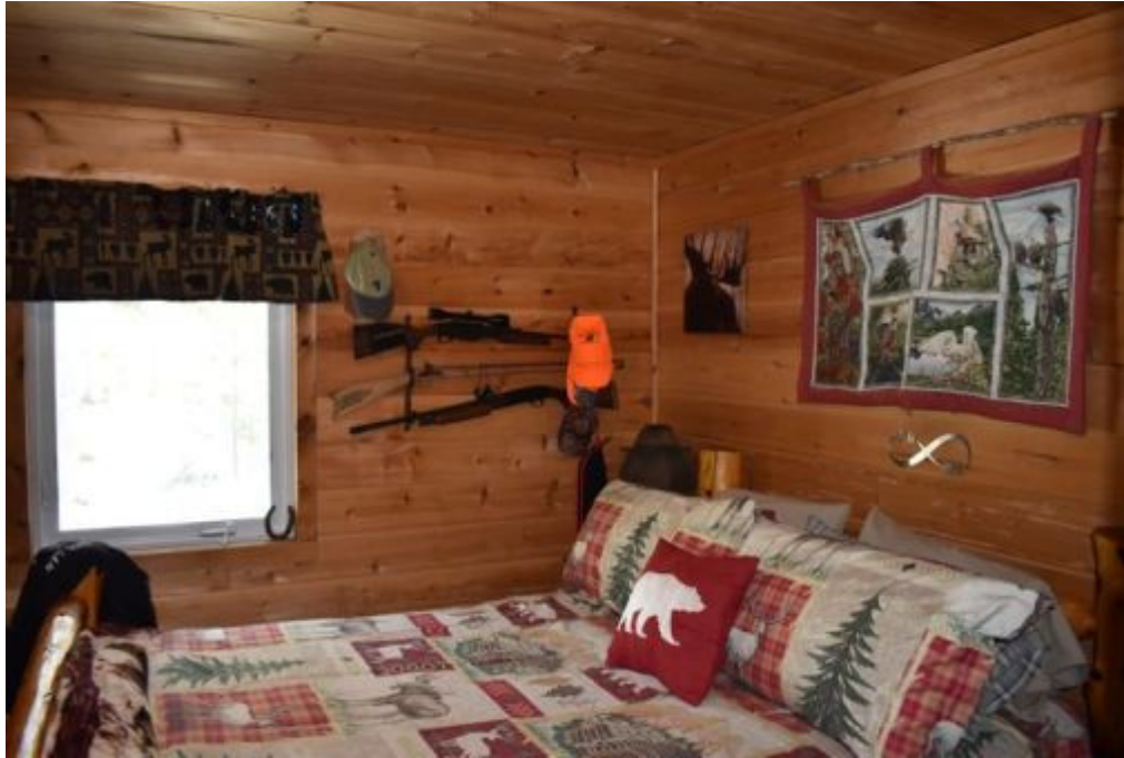
On the other side of the loft is this great second bedroom. Plenty of natural light, nice size room and a quiet place to lay your head.