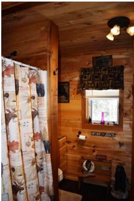
Beautifully designed full sized bathroom for this cabin. Plenty of lighting and with nice natural light. Located on main floor.