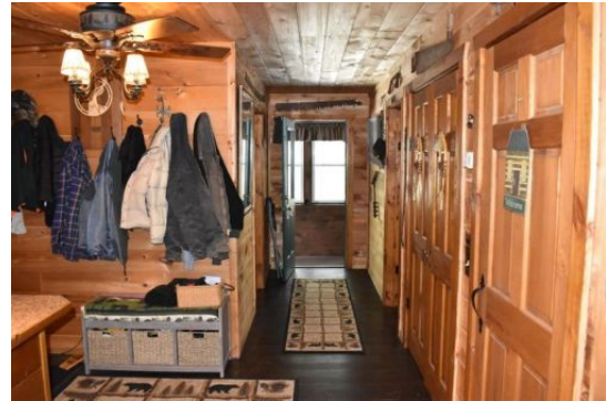
Interior hall view to sunroom/office.