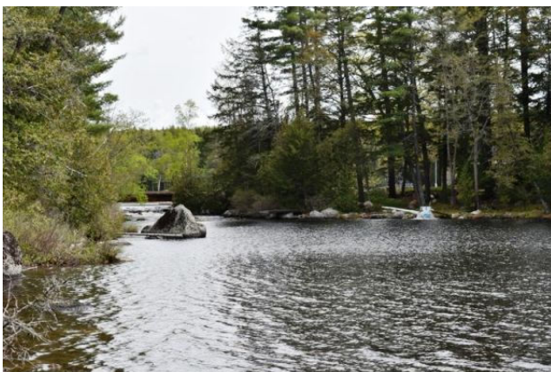
The Beautiful Nicatous Stream