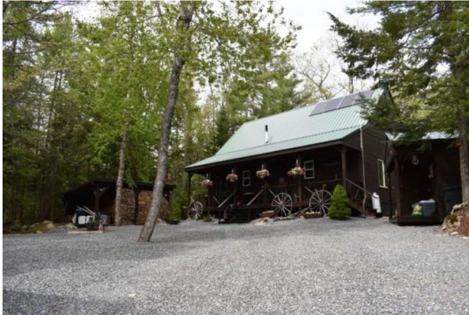
Great front porch on this cabin built in 2009. Imagine the sights, sounds and smells of Nature as the seasons come and go.