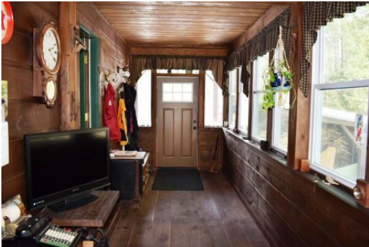
Cabin entrance to sunroom/office.